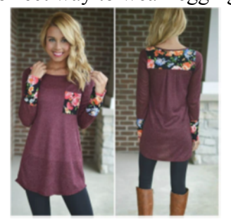
Correct way to wear leggings.