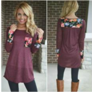
Correct way to wear leggings.